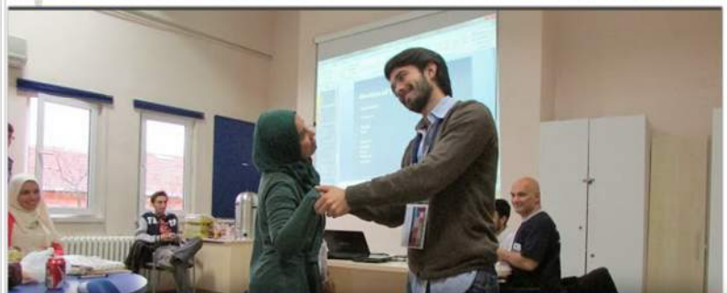
A MOMENT FROM GAR